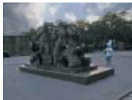
Enhanced using PE 3

To the left: Photo taken on the Photography & Digital Graph- ics SIG's field trip to Battery Park: