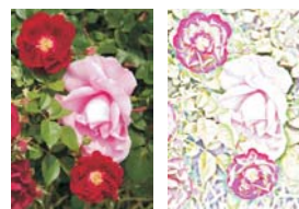
Above: Photo modified with an adaptation of Pointillism Recipe ("points" discarded): uses color burn, color dodge, and inversion

The second section, preceding the recipes, is a detailed journey through all of the layer blending modes. Each blending mode has its own pages, where Beardsworth describes how it works, when to use it, and how to apply and vary it. In this section I learned the artistic possibilities of inverting images, the effectiveness of the Overlay mode for correcting underexposed photos, and the usefulness of Pin Light and Hard Mix.